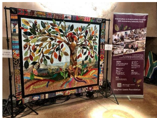
The quilt on display at the IGG in Winnipeg